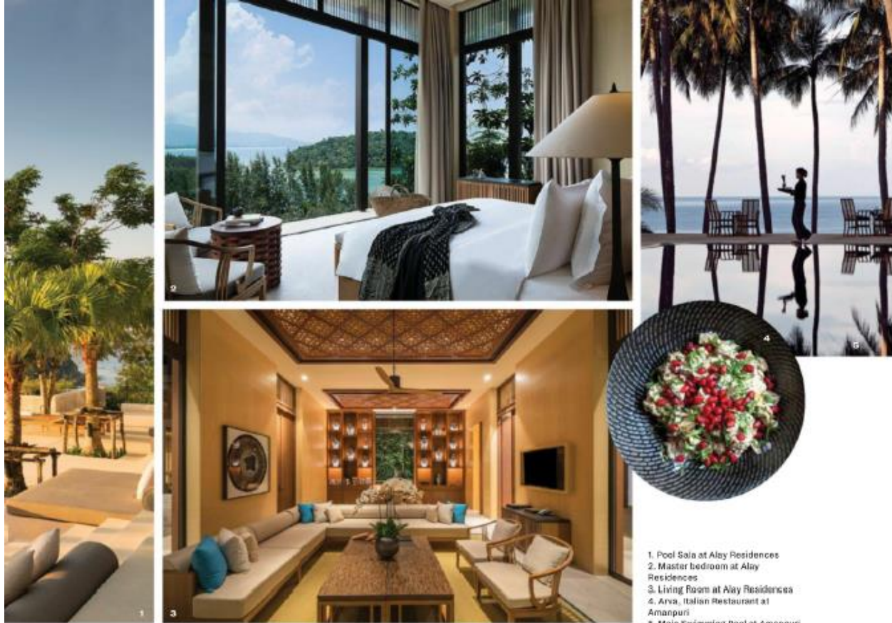
1. Pool Sala at Alay Residences 2. Master bedroom at Alay Residences 3. Living Room at Alay Residences 4. Arva, Italian Restaurant at Amanpuri 5. Main Swimming Pool at Amanpuri

Though we preferred sipping wine sitting in our verandah gazing at the stars. Alan would keep our glasses full and get me macaroons. I was still in a dream, while we shifted our holiday home to Amanpuri.